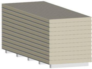
Figure 1. Standard arrangement of wall sandwich panels

As standard sandwich panels are delivered to the site packaged in accordance with diagram shown in figures 1 and 2. Figure 1 - applicable to wall sandwich panels and Figure 2 - applicable to roof sandwich panels.