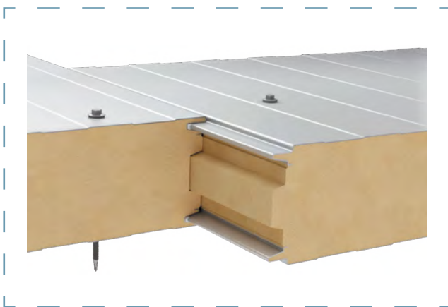
Panels connection scheme