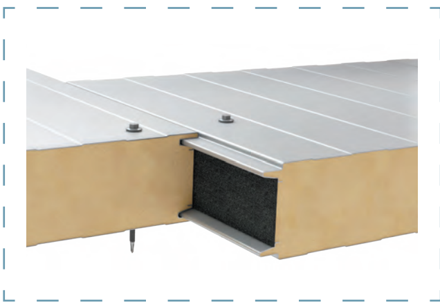
Panels connection scheme