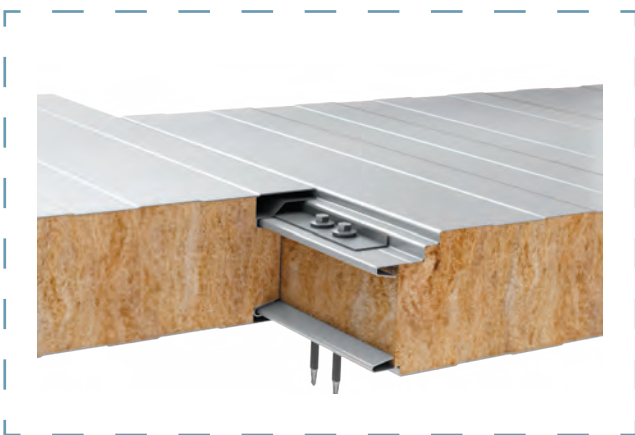
Panels connection scheme